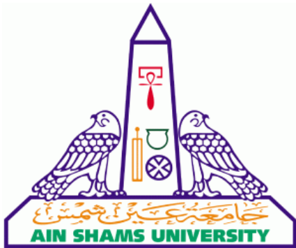
Ain Shams University Cairo