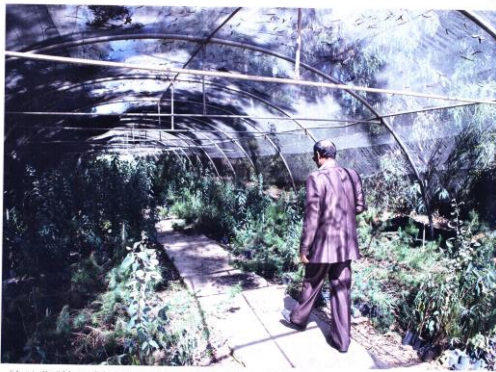
Schritt im Gespräch mit dem Fachkommissionen und Forum des Wissenschaftlichen Beirats